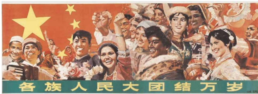
Plate 6 Long live the great unity of nationalities