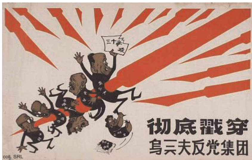
Plate 4 Completely root out the Ulanfu reactionary clique