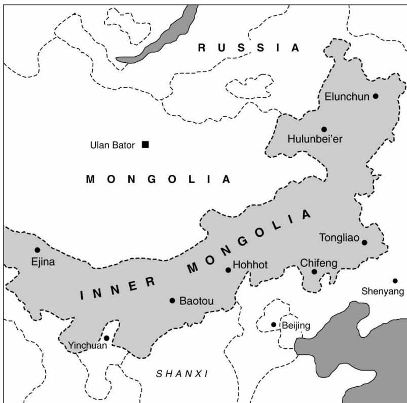
Figure 1 Inner Mongolia

“capitalist roader” and a revisionist. He was to die tragically, reportedly of untreated cancer, two years later. Deng Xiaoping, who was to make a spectacular return to power after Mao’s death a decade later, was also felled. By 1968 the balance sheet for China was to have only one Ambassador abroad (in Egypt), to be gearing up for war with the USSR (a war which, thankfully, only ever reached the stage of border skirmishes), and to be economically crippled and an international pariah. The legacy of the CR was to be seen in the grotesque Cambodian version in 1975–1979 Kampuchea, and the ongoing Maoist insurgency in Nepal.