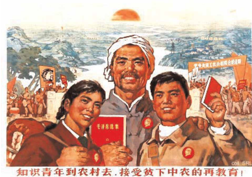
Plate 5 Intellectual youth, go to the countryside and receive re-education from the low and lower-middle class peasants