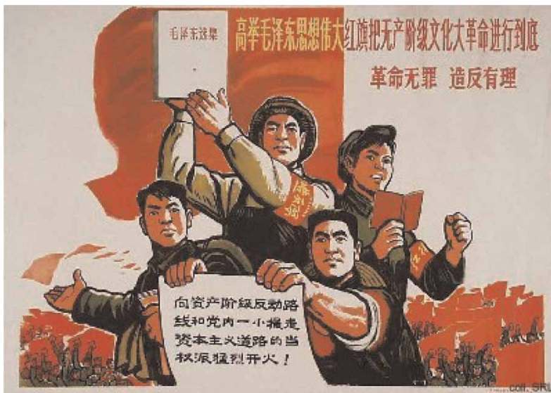
Plate 1 Making revolution is no crime: to rebel is justified. Open fire on the bourgeois reactionary line and on the handful of capitalist-roaders in the party