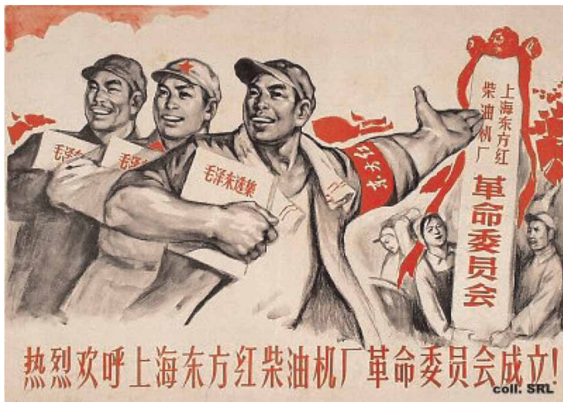
Plate 2 Warmly welcome the establishment of the Shanghai, East is Red, Diesel-Engine Factory Revolutionary Committee