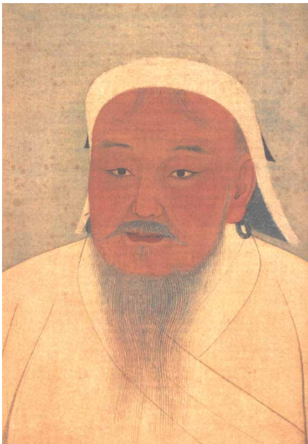
Figure 2 Genghis Khan

that he had achieved had lasted no more than a century. His armies had devastated whole regions of the north-west of China. He was the feudalist par excellence , creator of a society of slavery and exploitation. 9