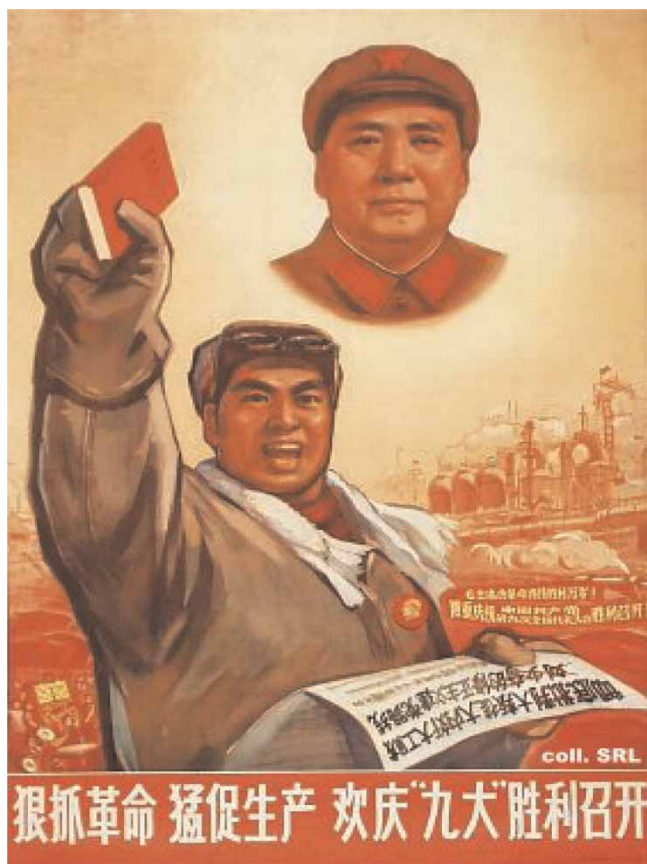
Plate 7 Greet the holding of the Ninth Congress by grasping revolution and boosting production